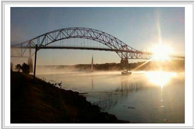
Cape Cod Canal Sunrise