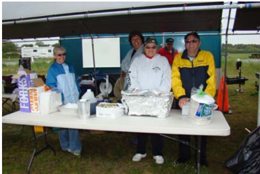
Friends of Scusset Beach

Sam's Cape Codders – Pancake Breakfast June 6 th - proceeds to benefit Scusset Beach State Park