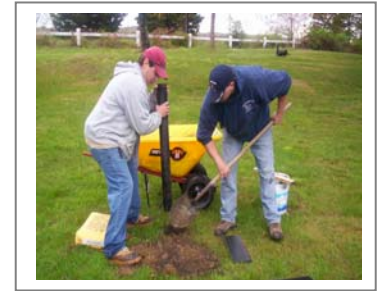
Volunteers installing grills at the new Fish Pier picnic area